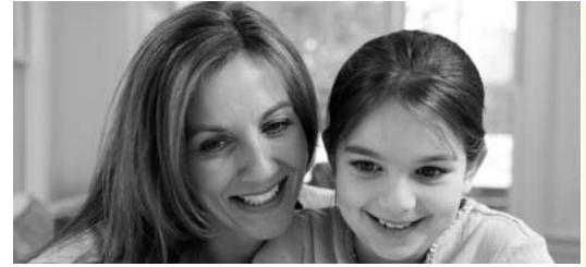
Someone like Amber wants a health insurance plan that provides her family a wider range of benefits. She may prefer the lower deductibles and lower out-of-pocket costs of Personal Select.