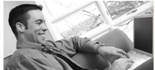
Someone like Peter is looking for a plan where he doesn't have to pay for benefits he may not use. He would still like coverage should he be in an accident or is affected by a medical condition. Peter may find the benefits with Personal Benefit (HDHP) a good fit for his health insurance needs.